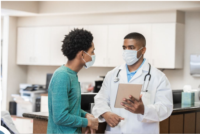
Go to Urgent Care