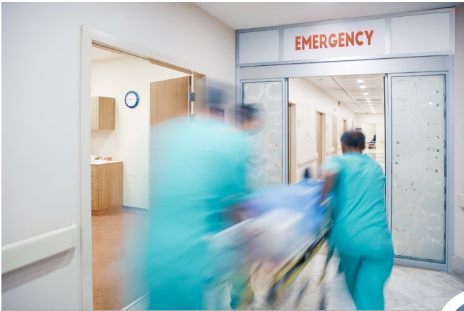
Go to Emergency Room

For non-life-threatening problems, call your doctor, access Capital Blue Virtual Care platform or go to an urgent care center.